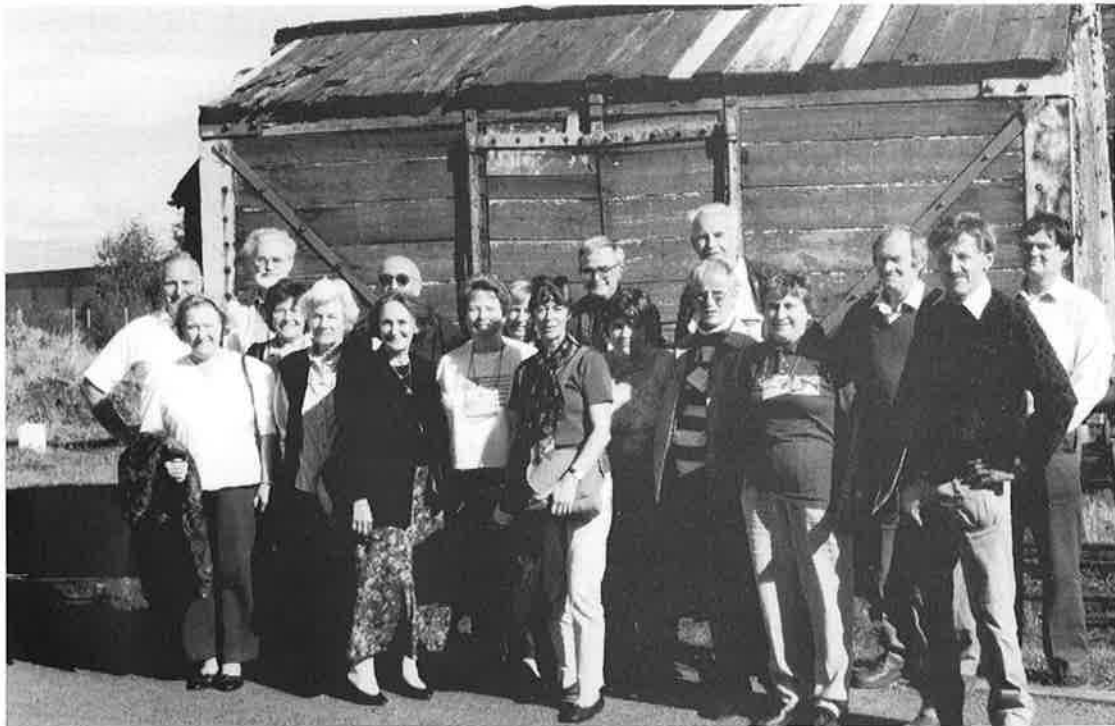
Some members of the Tools and Trades Society during their visit to the Lion Works gather for a group photograph beside the pitched roofed salt van.

The Tools and Trades Society was established "to advance the education of the general public in the history and development of hand tools and their use and of the people and trades that used them". If you would like further information about the society membership details can be obtained from The Administrator, TATHS, 60, Swanley Lane, Kent, BR8 7JG.