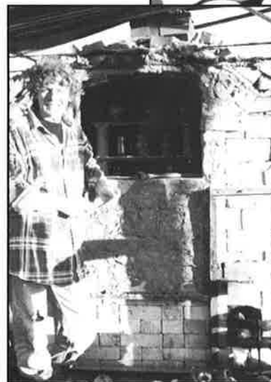
First view of glazed pots.