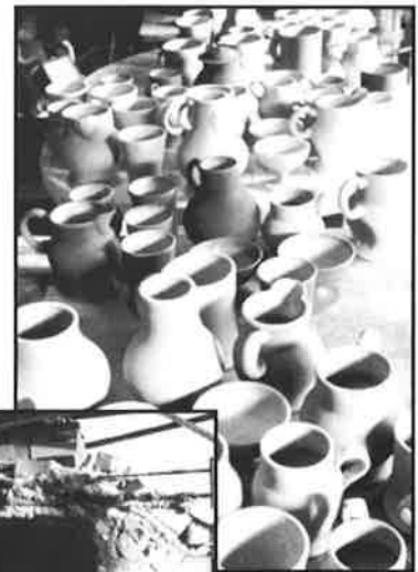
Preparation for firing.