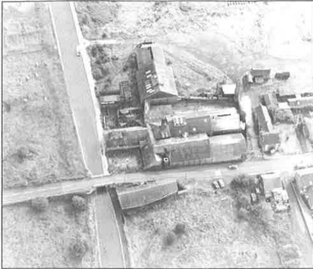
Aerial view of Lion Salt Works.