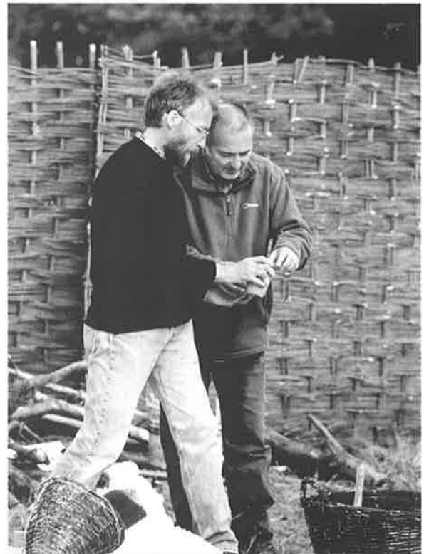
Photograph by Garth Tomkins, Clacton.