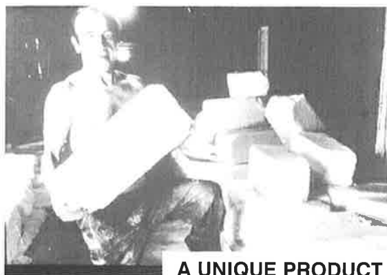
A UNIQUE PRODUCT

‘Restoration’ is a BBC 2 series to be broadcast in July that seeks viewer votes for a building project to receive a Heritage Lottery Fund Grant.