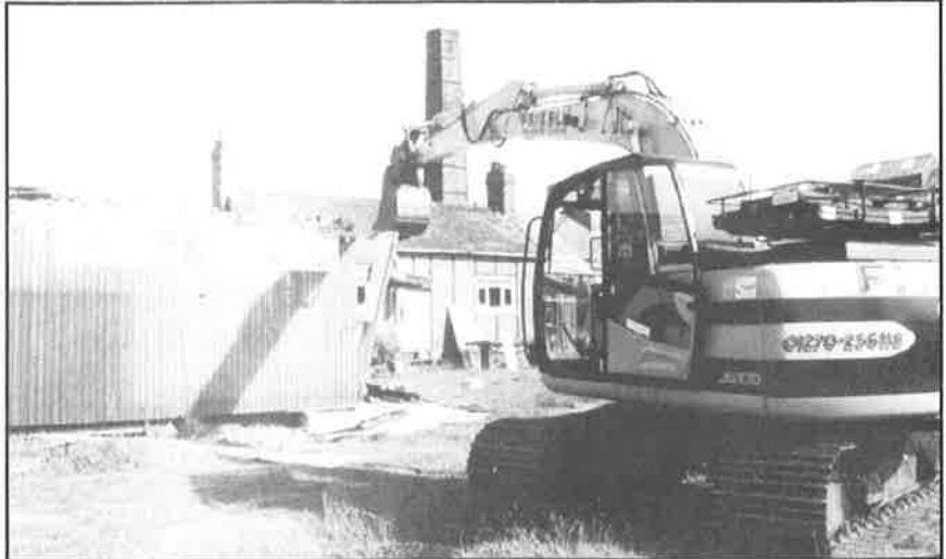
Demolition of classroom.

The Trust's first display cabinets were all built there by our team of volunteers. More recently it was used as the construction site for the pergola and trellis around the herb garden.