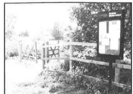
New entrance from canal.