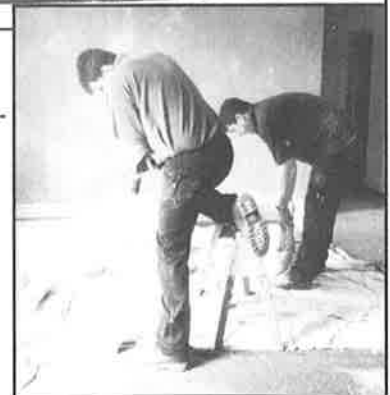
Contract Services from Vale Royal Borough Council refitted the exhibition building in 10 days.