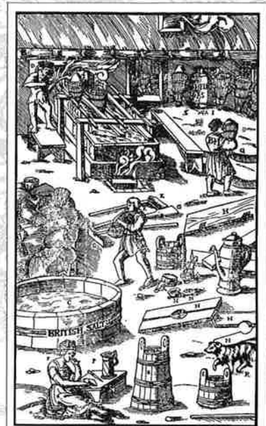
Ancient Salt Making

To mark the success of our salt boiling events this summer a card has been printed to mark the first salt to be made at the works since 1986.