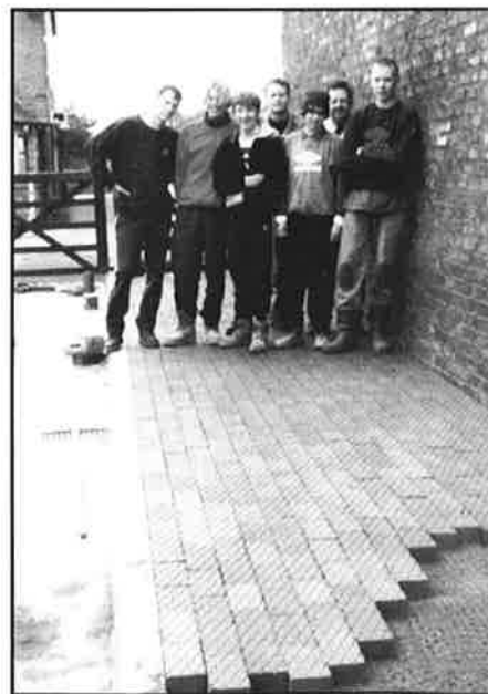
The team take time off to inspect their work.

A selection of nest boxes will also be erected around the site. We know that blackbirds, sparrows, collard doves, starlings and swallows build nest each year around the site and would also like to encourage the robins, tits and wrens our other common species.