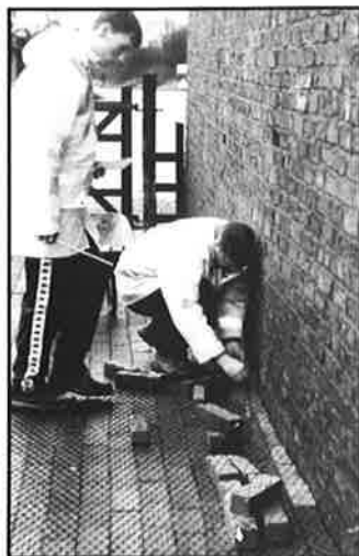
Fitting the final pieces of the puzzle.

The Spring, 2000 newsletter will report on the completion of many of these proposals. Some will take time to mature and develop but will improve the appearance of the works and enhance future demonstrations and events which will be held at the site.