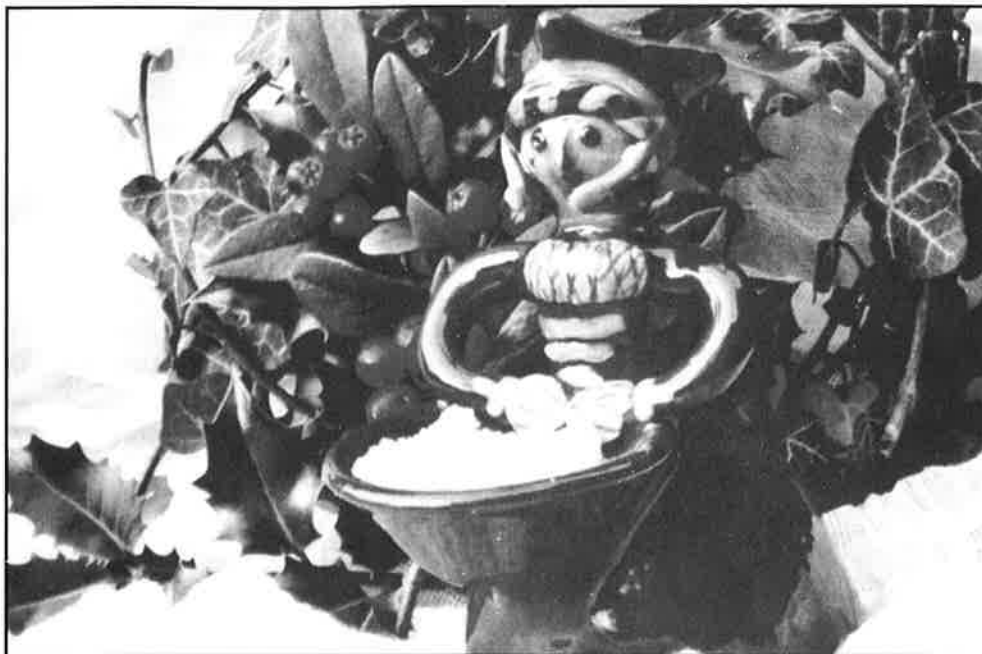
Table salt made by John Hudson. Based on a sixteenth century salt figurine defining one's position at table 'above' or 'below' the salt.