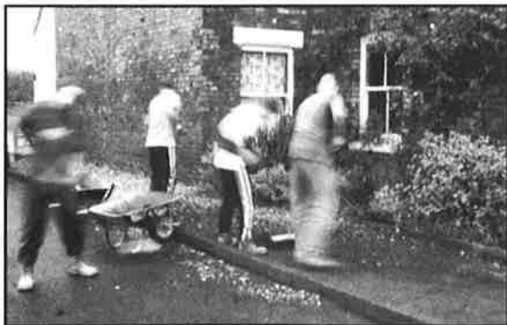
Clearing the site of gravel.