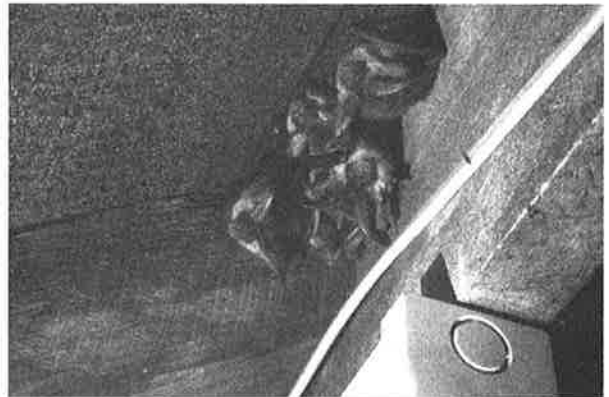
Six long eared brown bats photographed in our loft. We hope to arrange a bat walk on site in August 2009 so you can see and hear our own bats flying around the grounds.

A half hour programme on BBC Radio 4 was Broadcast on Wednesday, 5 November, 2008. Thought it concentrated on rock salt mining, Presenter Allan Beswick Visited the Lion Salt Works and Ashton's Flash to uncover information about early mines and open pan salt making.